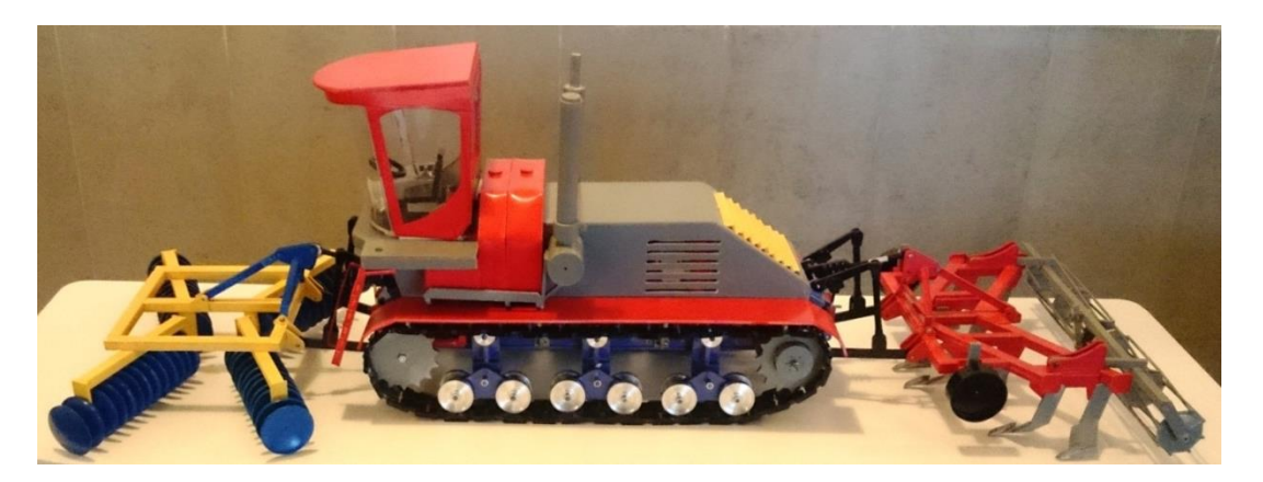
Fig 2: ModelMPU-5300

Figure 3 shows a diagram of MTA based on the MPU-5300 with a mounted forage harvesting adapter (in this case maize harvesting for silage) and an adapter on the rear mounted system to prepare the soil for sowing winter wheat, which prepares the ground simultaneously with harvesting maize for silage. In more detail, the aggregation options are considered in [11].