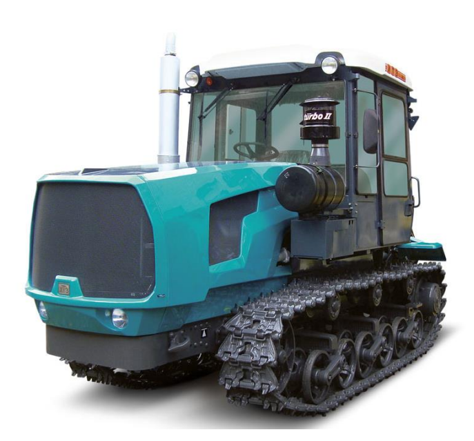
Fig 1: TractorKhTZ-181

Notwithstanding the provided fundamental advantages of track tractors as compared to the wheeled ones, the production of the latter was stopped, and only the holding "Agromash" starts renewing their production (we are talking about the tractors for agricultural purposes). However, the strategic direction of this deployment, as the analysis shows, consists in the resuscitation of the machines of the fourth generation , which in general have already been designed. We should also note that, if we had worked on the tracked tractors of mass production, then, firstly, Russia would have already had the mass production of such tractors of the fifth generation , which would have inevitably been associated with the more advanced technological processes, and secondly, the "socio-political" drawback of a tracked vehicle —the steel tracks, on which it is impossible to drive along the paved roads — would have been successfully overcome, for the rubber reinforced crawler tracks are already available commercially.